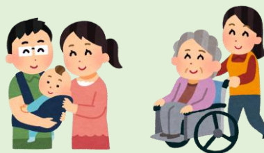
(人) Foreign Residents in Minokamo City

Planning support measures to improve the quality of life for everyone.